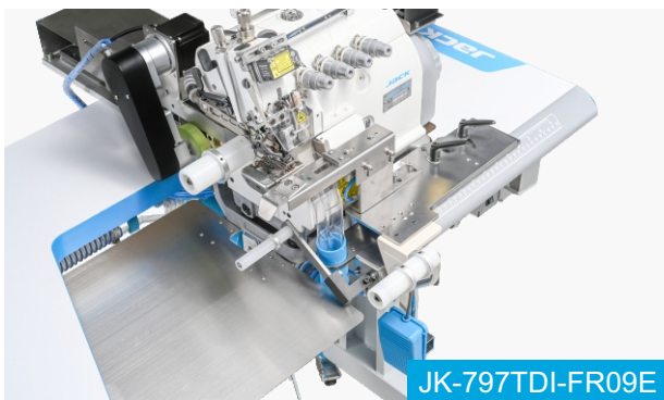
Big operation space